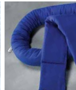
SuperSocks ™ , FlatSocks ™